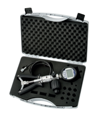
Basic version incl. pneumatic pressure generation

Available measuring ranges see specifications