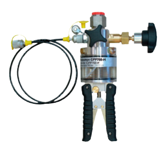
Hydraulic hand test pumps model CPP700-H or model CPP1000-H

Further specifications see data sheet CT 91.07