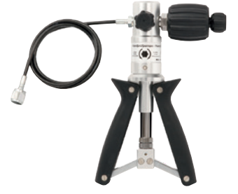
Pneumatic hand test pump model CPP40

Pressure range: -0.95 ... +40 bar [13.8 ... 580 psi]