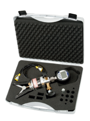
Basic version incl. hydraulic pressure generation