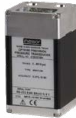
Precision Pressure Transducer, Model CPT6180

They are used as reference pressure transducers within the automated manufacturing of pressure measuring instruments or calibration stands. Through a high accuracy, speed of reading and long-term stability, these are particularly suited for applications in wind tunnels or in pressure chambers. These characteristics make it a valuable tool in metrology, hydrology, oceanography, and in the aviation and space industries.