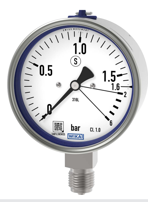
Bourdon tube pressure gauge, model 232.36, NS 100 [4"]