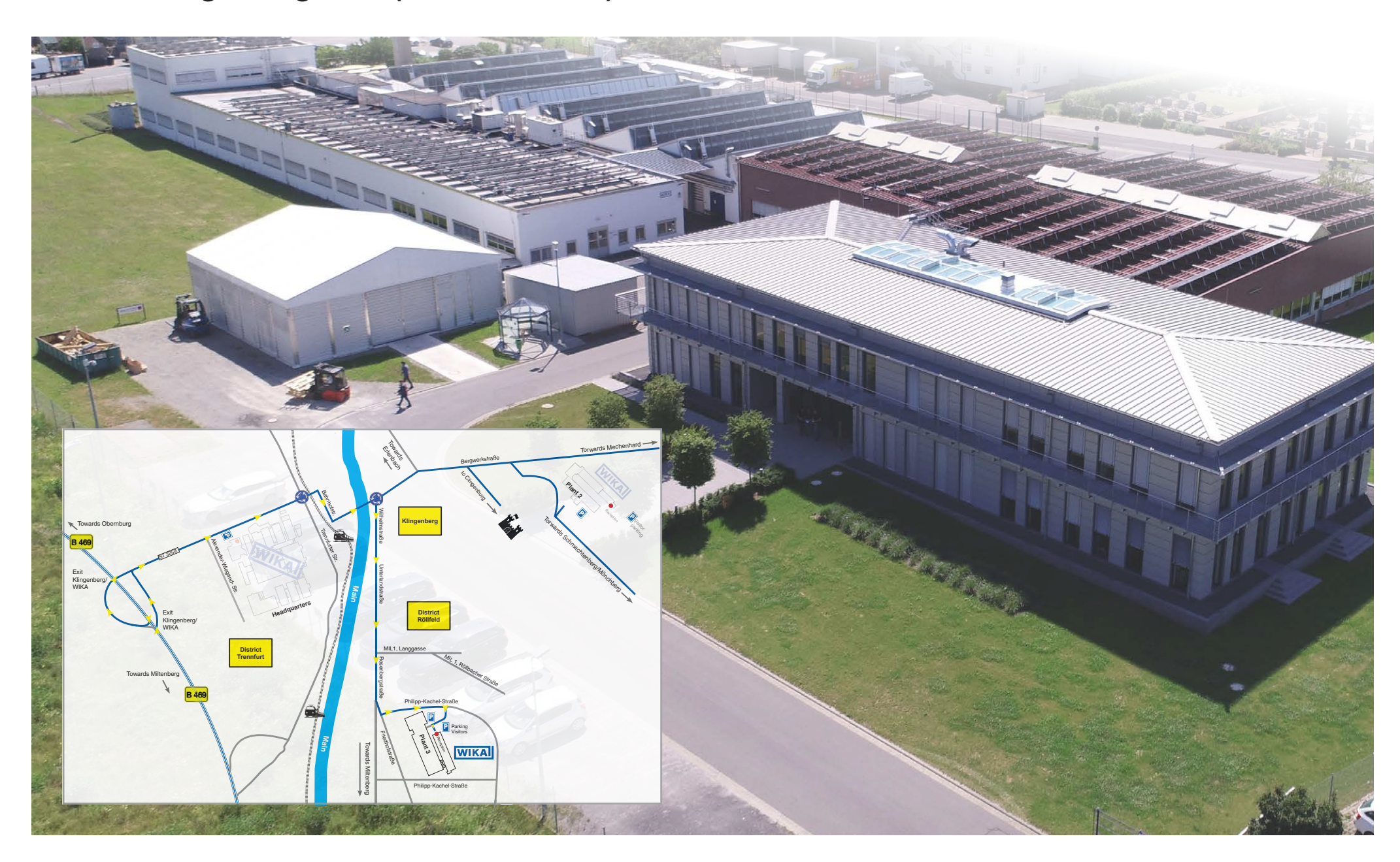
Plant 3 - Klingenberg/Main (district Röllfeld)